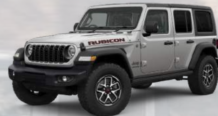
PSE - Silver Zynith (Option)