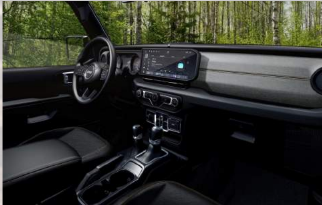
E7X9 - Black Cloth (Standard - Sport S)

Option (O) Standard (S) Not Available (-)