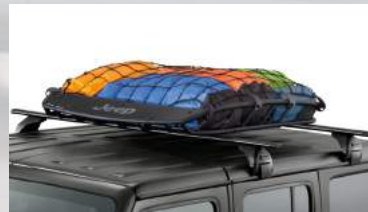
Roof Rack Kit