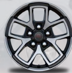
WFV 17-Inch Machined Painted Black Wheels (Standard on Rubicon)