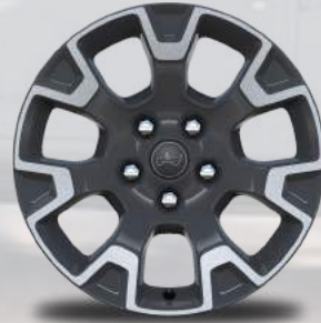
WPD 18-Inch Machined Painted Grey Wheels (Optional on Overland)