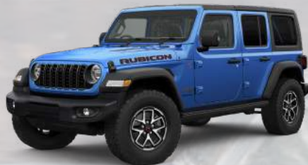
PBJ - Hydro Blue (Option)