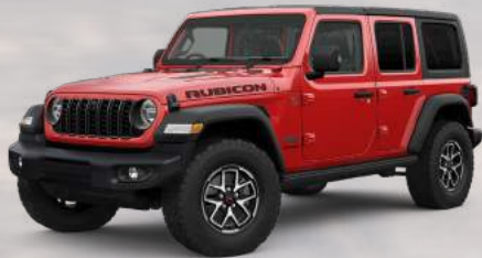
PRC - Firecracker Red (Option)