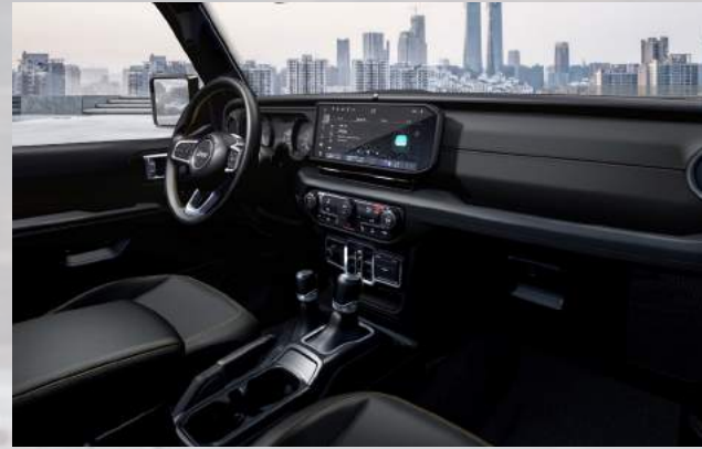
BPX9 - Black McKinley Premium with Jeep Logo (Standard - Overland)