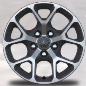
WFH 17-Inch Machined Wheels with Black Pockets (Standard on Sport S)