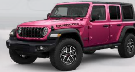
PHP- Tuscadero (Option) From March 2024 production