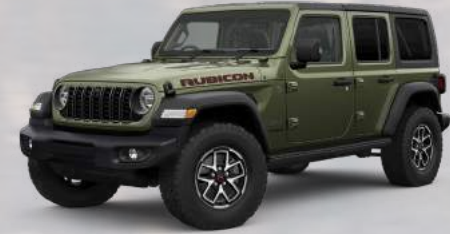
PGG - Sarge (Option)