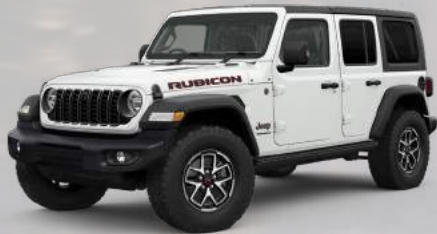
PW7 - Bright White (Standard)