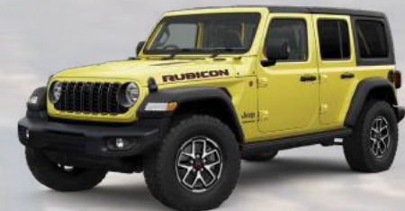
PJF - High Velocity (Option)