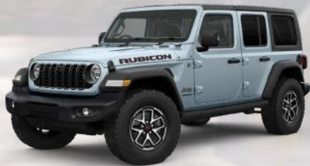
PGP - Earl (Option)