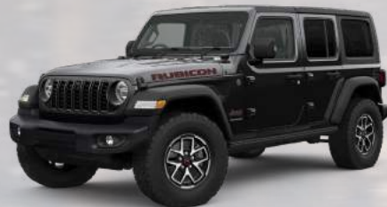
PX8 - Black (Option)