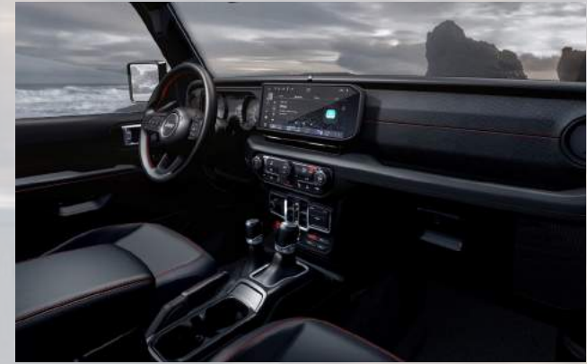
VLX9 - Black Nappa Leather Trimmed Bucket Seats (Standard - Rubicon)