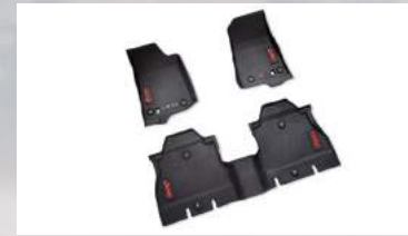
All Weather Mats