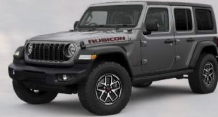
PAU - Granite Crystal (Option)