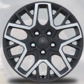
WPA 18-Inch Machined Painted Grey Wheels (Standard on Overland)