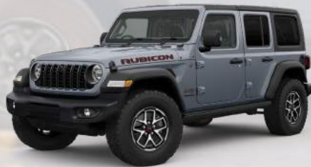
PDS - Anvil (Option)